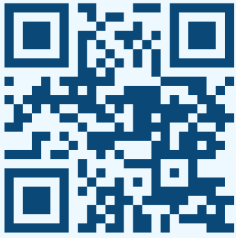
LNPS OSHC Website