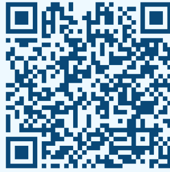
OSHC Parent Handbook