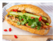
Vietnamese rolls (Banh Mi)